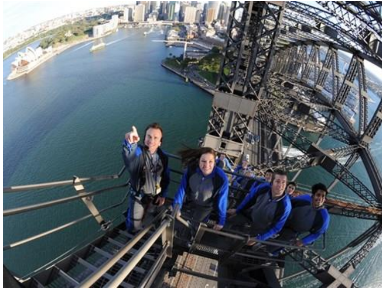
Climbing Sydney Harbour Bridge