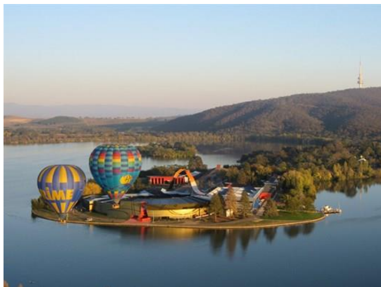
Views from the air during the Canberra Balloon Spectacular

Think about views, but make sure you're captioning views appropriately e.g. "view from the top of the nearby hill", or "Dining room view from units 1-4".