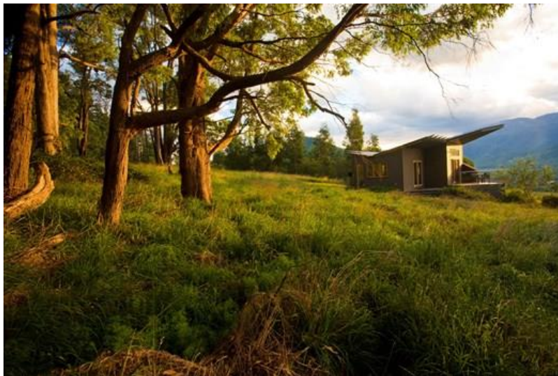
Enjoy wide open spaces at The Buckland – Studio Retreat near Bright